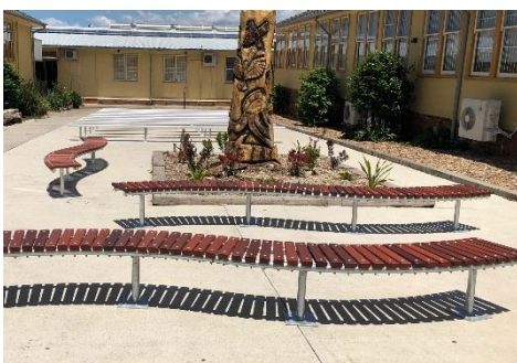
EM038 timber batten option