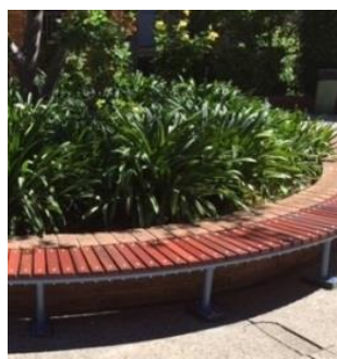
EM038 with powdercoated base option