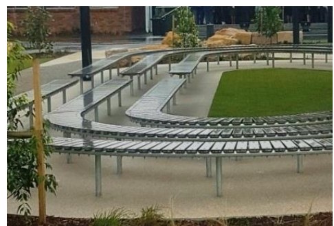
EM038 composite batten option